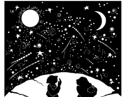
THERE WILL BE SIGNS in the sun, the moon, and the stars