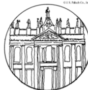
The Dedication of the Lateran Basilica

We appreciate your donation of a complete family bag or any of the individual items above!! Please bring to mass on November 10 & 11. God Bless!