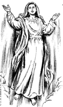
Assumption of the Blessed Virgin Mary

Thank you and may God you for your generosity.