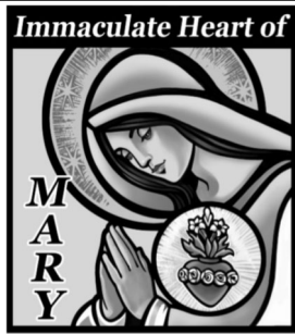
SATURDAY JUNE 9TH